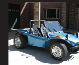
1958 Volkswagen Dune Buggy