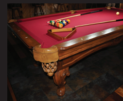
8' Pool table, Connelly Billiards 1-1/4" Slate, Pro cues & balls