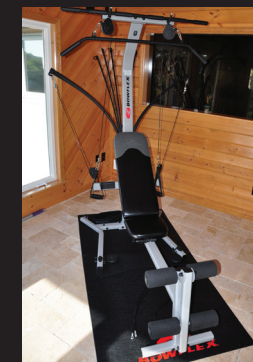
Bowflex exercise machine