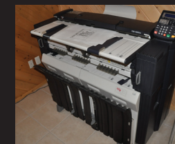
Kyocera wide-format blueprint machine & copier