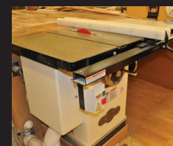
Table saw, commercial grade