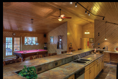
Kitchen features a huge, accommodating breakfast bar