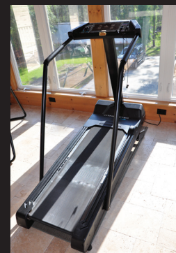
Treadmill, commercial quality