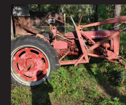
Farmall 200 tractor including loader. Grader blade & plow are also available and will also be auctioned separately