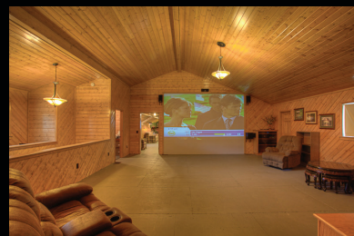
Spacious family room perfect for relaxing or hosting guests