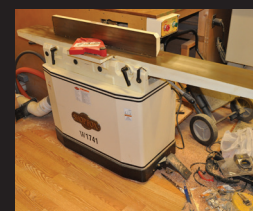
Jointer/planer, commercial grade