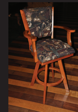
Swivel bar stools