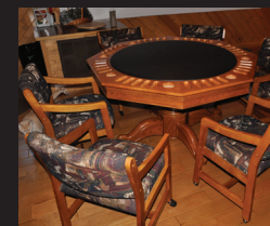
Oak Poker Table double sided oak/felt