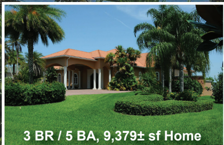
3 BR / 5 BA, 9,379± sf Home