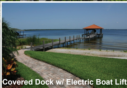
Covered Dock w/ Electric Boat Lift