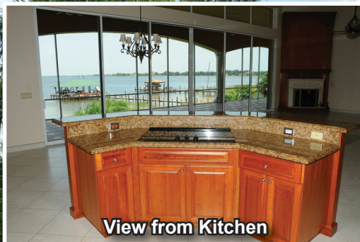
View from Kitchen