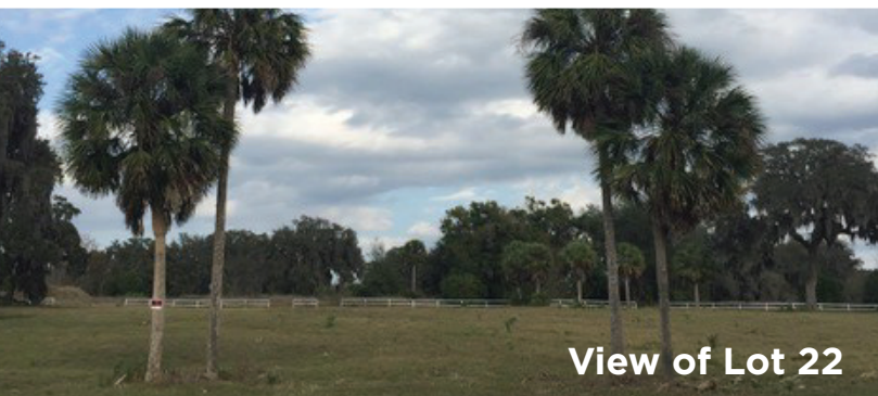
View of Lot 22