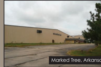
Marked Tree, Arkansas