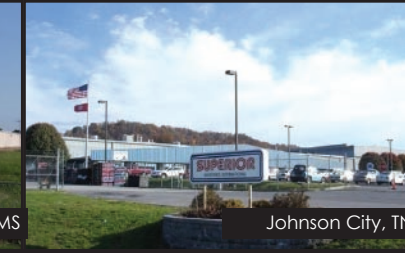
Johnson City, TN