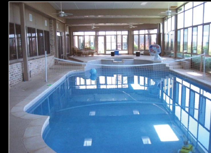
Pool/spa located in huge climate-controlled enclosed lanai

PREVIEW THIS FINE HOME: SATURDAY AND SUNDAY, JULY 11-12 AND 18-19 FROM 10 AM - 3 PM AND WEDNESDAY, JULY 22 FROM 3 PM - 6 PM