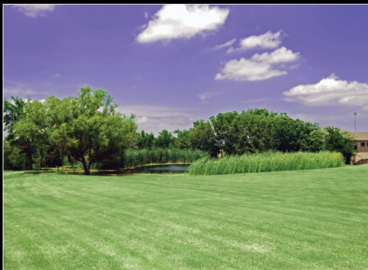
Situated on a gracious 2.86± acres