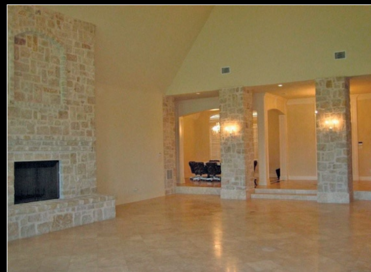
Beautifully appointed great room