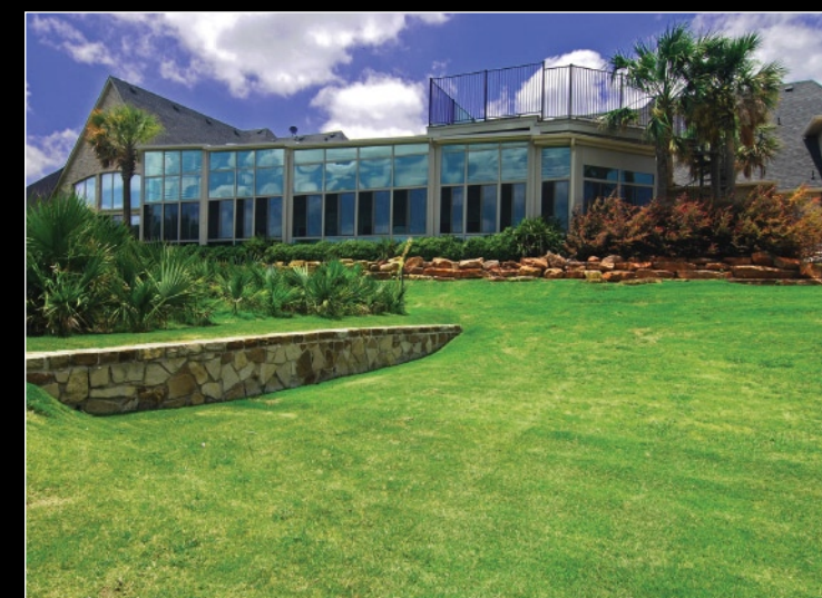
Elegant luxury home in Rockwall County