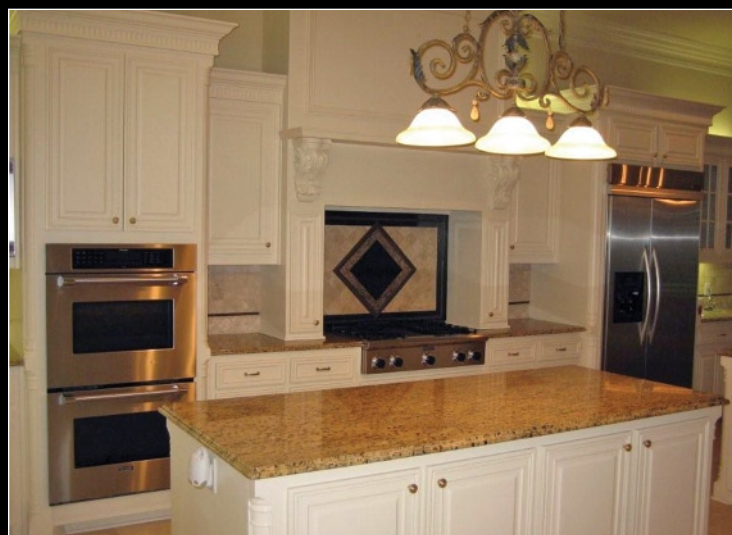
Spacious kitchen, fully-equipped for entertaining