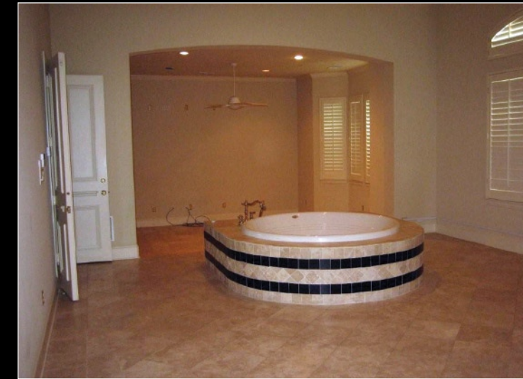
Master Suite with freestanding hot tub