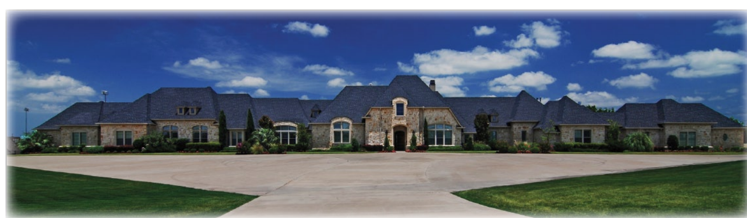
AUCTION ON SITE: 1705 BISON MEADOWS LANE, HEATH (DALLAS AREA), TEXAS 75032

Located in Heath's prestigious The Hills of Buffalo Creek community, this spectacular home features every luxury imaginable, from the fully appointed gourmet kitchen to the opulent dual master suites, modeled after the suites in Caesar's Palace, Las Vegas.