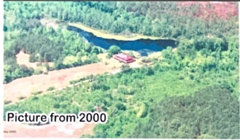
Picture from 2000